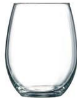
STEMLESS WINE GLASS