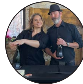
Table Busing Service available upon request

For an estimate or more information contact info@goodtimesbarnyc.com www.goodtimesbarnyc.com